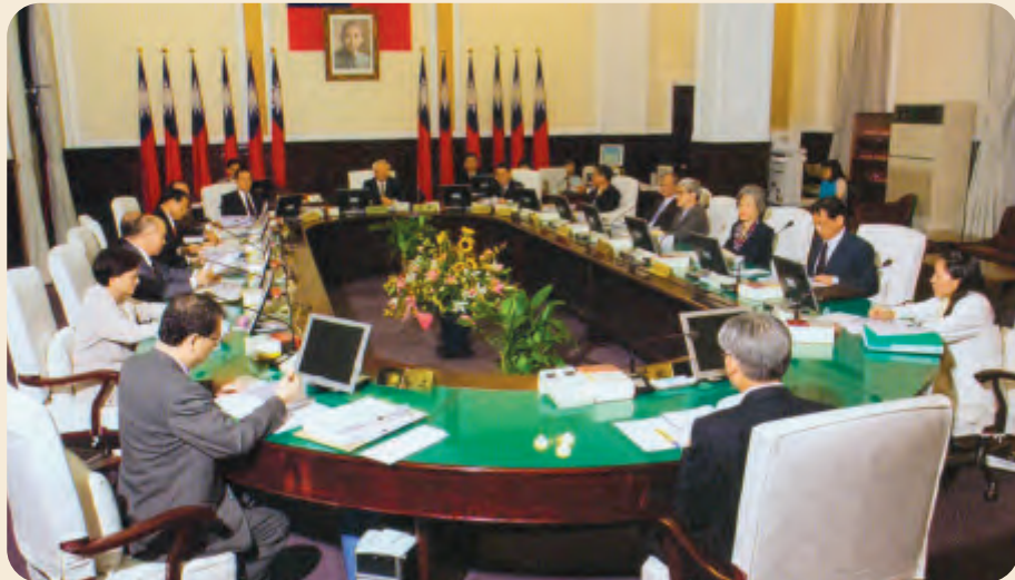
The Meeting of the Justices of the Constitutional Court (Photographed in Nov. 2003)