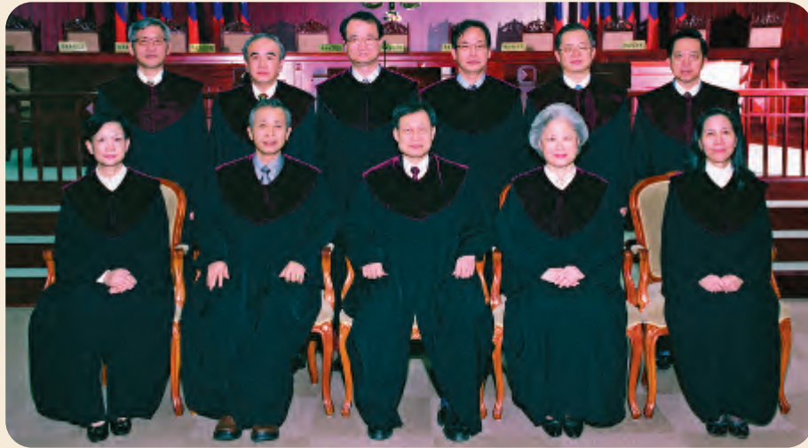
Justices of the Constitutional Court (Photographed in Nov. 2007)