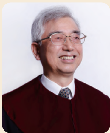
Chen-Huan WU (吳陳鐸) Justice of the Constitutional Court (Oct. 2015-)