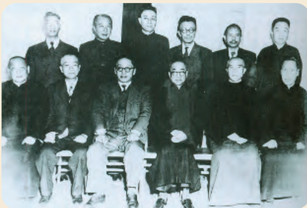
Justices of the First Constitutional Court & Heads of the Judicial Yuan (Apr. 1952)

The Constitution only provides for the powers and the appointment process of the Justices. It leaves blank the number, qualifications, and terms of office of the Justices. The Judicial Yuan Organization Act, enacted in March 1947, stipulated that there were to be nine Justices with life tenure, apparently modeled after the U.S. Supreme Court. In December of the same year, the Judicial Yuan Organization Act was revised to the effect that there were to be seventeen Justices, each serving a fixed and renewable nine-year term. The first ten Justices were sworn in as members of the First Constitutional Court in July 1948 and held their first meeting in September 1948. After rendering the first two J.Y. Interpretations in Nanjing, China, in January 1949, the First Constitutional Court soon ceased to function because of the outbreak of war in China. Although the acting President once appointed eight new Justices in March 1949, as of the end of 1951 there were only two Justices remaining in office in Taiwan. In other words, the Constitutional Court was not in operation for around three years between February 1949 and March 1952. In April 1952, seven newly-appointed Justices joined the Constitutional Court, which then had nine Justices and finally met the quorum of a majority of seventeen members. This re-organized First Constitutional Court