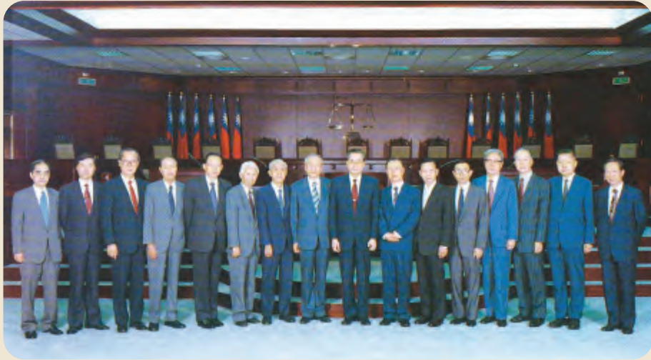
Justices of the Fifth Constitutional Court & Heads of the Judicial Yuan (Photographed in 1994)