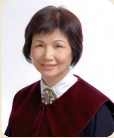
Chong-Wen CHANG (張瓊文) Justice of the Constitutional Court (Nov. 2016-)