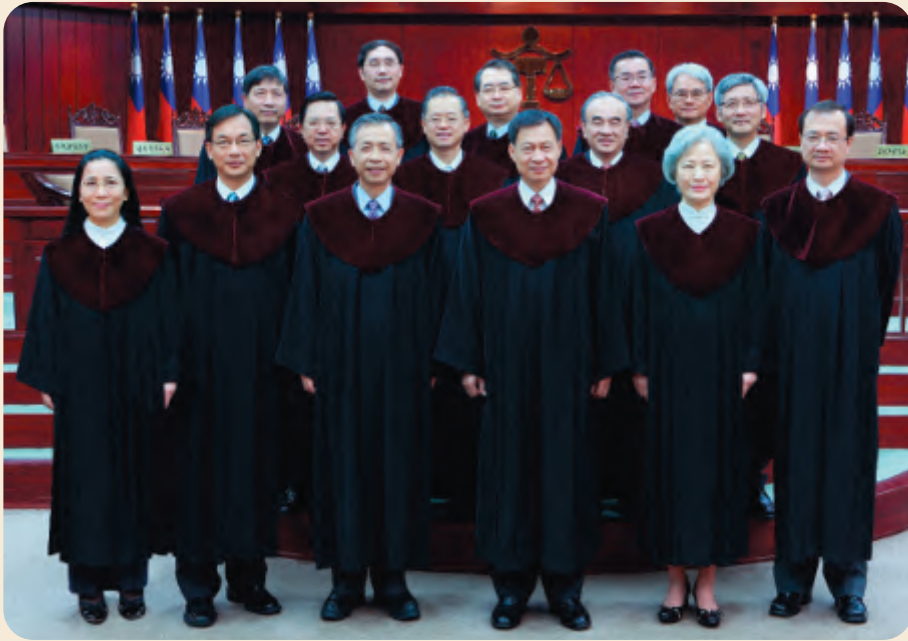
Justices of the Constitutional Court (Photographed in Nov. 2008)