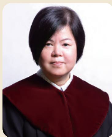
Horng-Shya HUANG (黃虹霞) Justice of the Constitutional Court (Oct. 2015-)