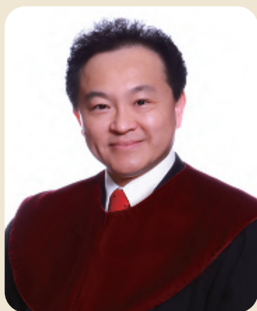
Dennis Te-Chung TANG (湯德宗) Justice of the Constitutional Court (Oct. 2011-)