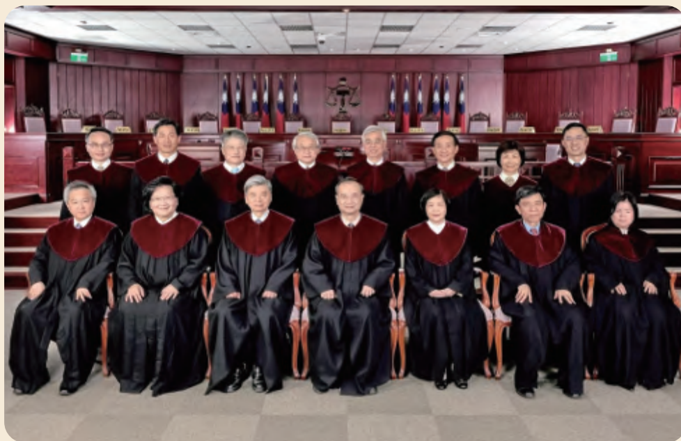
Justices of the Constitutional Court (Photographed in Nov. 2016).