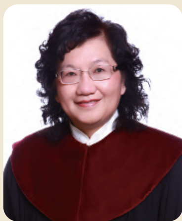
Hsi-Chun HUANG (黃璽君) Justice of the Constitutional Court (Oct. 2011-)