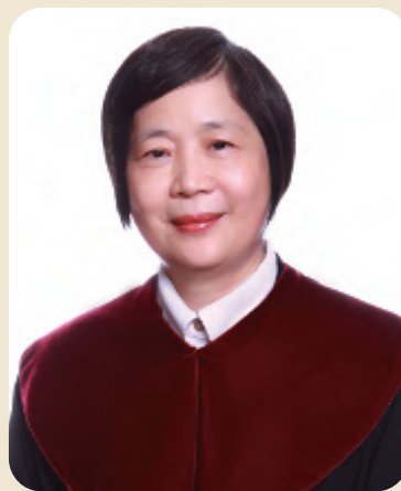
Beyue SU CHEN (陳碧玉) Justice of the Constitutional Court (Oct. 2011-)