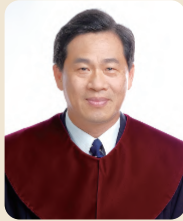
Jui-Ming HUANG (黃瑞明) Justice of the Constitutional Court (Nov. 2016-)