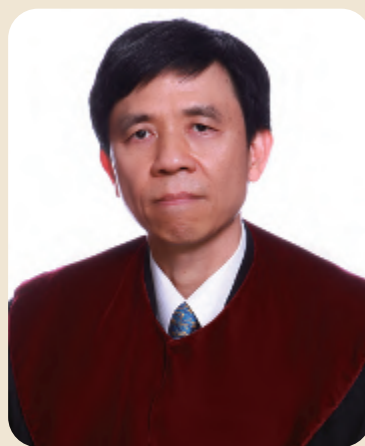
Chang-fa LO (羅昌發) Justice of the Constitutional Court (Oct. 2011-)