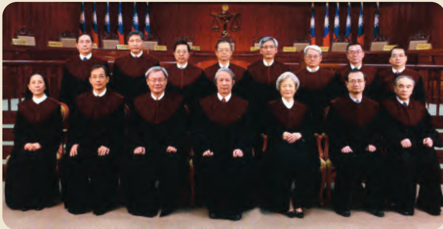
Justices of the Constitutional Court (Photographed in Nov. 2010)