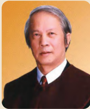
Hau-Min RAI (賴浩敏) Justice of the Constitutional Court & President of the Judicial Yuan ( Oct. 2010-Oct. 2016)