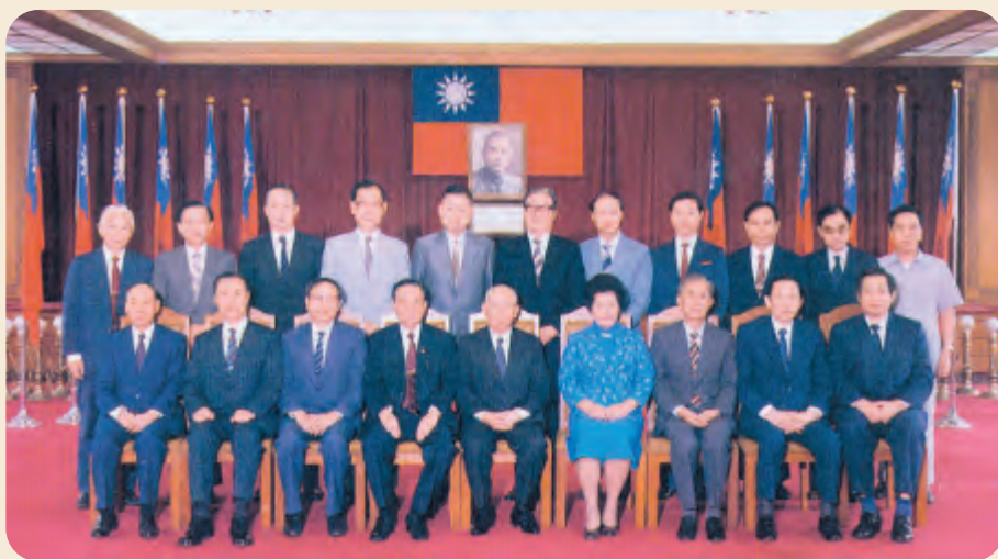
Justices of the Fifth Constitutional Court & Heads of the Judicial Yuan (Photographed in Oct. 1985)