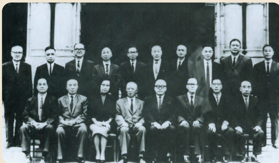
Justices of the Third Constitutional Court & Heads of the Judicial Yuan (Photographed in Oct. 1967)