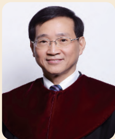
Jiun-Yi LIN (林俊益) Justice of the Constitutional Court (Oct. 2015-)