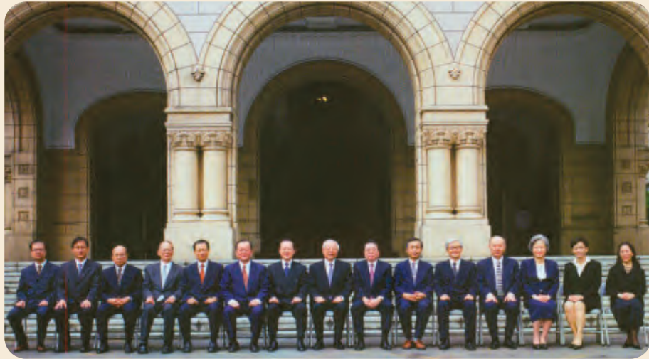
Justices of the Constitutional Court (Photographed in Nov. 2003)