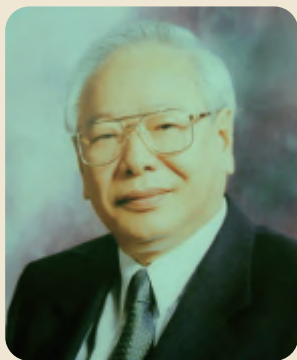
Yueh-Sheng WENG (翁岳生) Justice of the Constitutional Court & President of the Judicial Yuan (Oct. 2003-Sep. 2007)

October 2003 was a watershed in the history of the Constitutional Court in terms of its institutional design. A constitutional amendment adopted in 1997 addressing the number, terms of office, and appointment process of the Constitutional Court Justices took effect in October 2003. Article 5 of the Additional Articles of the Constitution reduces the number of Justices from seventeen to fifteen. The Justices, including the ones serving as the President and Vice President of the Judicial Yuan, are appointed by the President with confirmation of the Legislative Yuan. Except for those seven Justices appointed to serve for four years in 2003, all of the other Justices, then and thereafter, serve a non-renewable, eight-year term on a staggered basis.