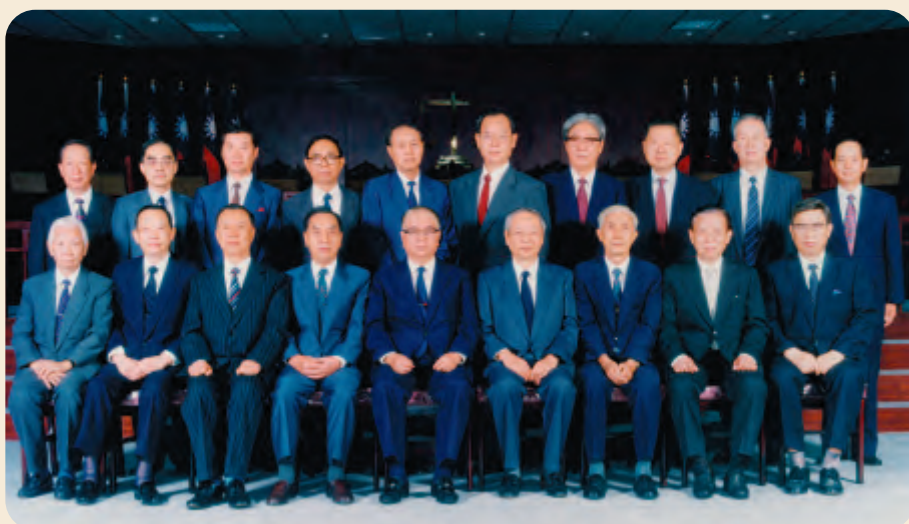
Justices of the Fifth Constitutional Court & Heads of the Judicial Yuan (Photographed in 1987)