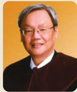
Yeong-Chin SU (蘇永欽) (Oct. 2010-Sep. 2016)