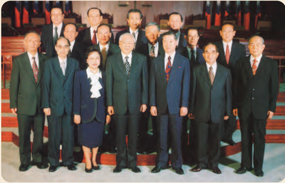
Justices of the Sixth Constitutional Court & Head of the Judicial Yuan (Photographed in 1999)