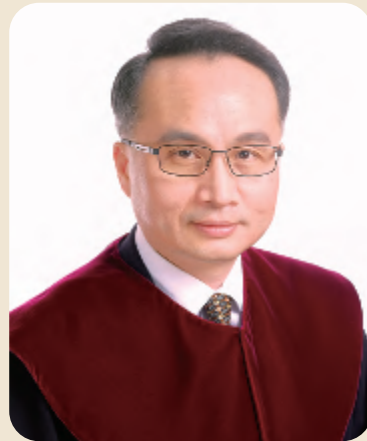
Jau-Yuan HWANG (黃昭元) Justice of the Constitutional Court (Nov. 2016-)