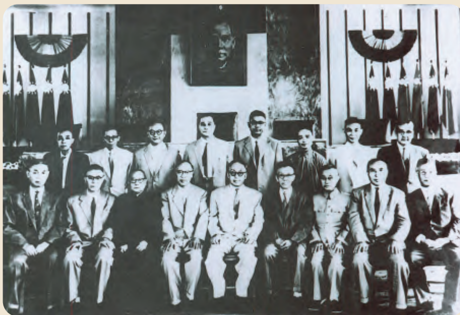
Justices of the Second Constitutional Court & Heads of the Judicial Yuan (Photographed in Sep. 1958)