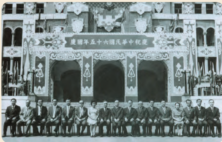
Justices of the Fourth Constitutional Court & Heads of the Judicial Yuan (Photographed in Oct. 1976)