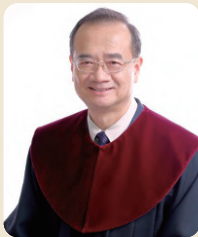
Tzong-Li HSU (許宗力) Chief Justice of the Constitutional Court & President of the Judicial Yuan (Nov. 2016-)