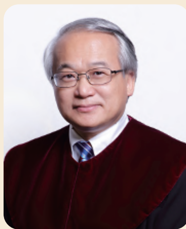
Ming-Cheng TSAI (蔡明誠) Justice of the Constitutional Court (Oct. 2015-)