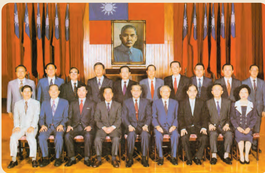
Justices of the Sixth Constitutional Court & Heads of the Judicial Yuan (Photographed in Oct. 1994)