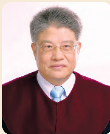
Chih-Hsiung HSU (許志雄) Justice of the Constitutional Court (Nov. 2016-)