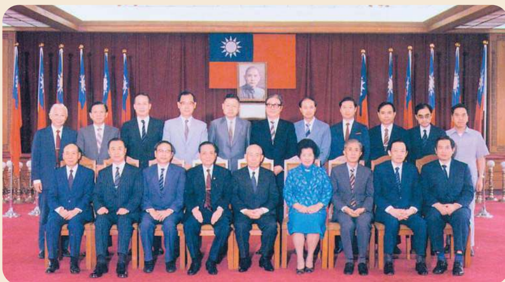
Justices of the Fifth Constitutional Court & Heads of the Judicial Yuan (Photographed in Oct. 1985)