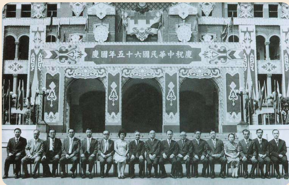
Justices of the Fourth Constitutional Court & Heads of the Judicial Yuan (Photographed in Oct. 1976)