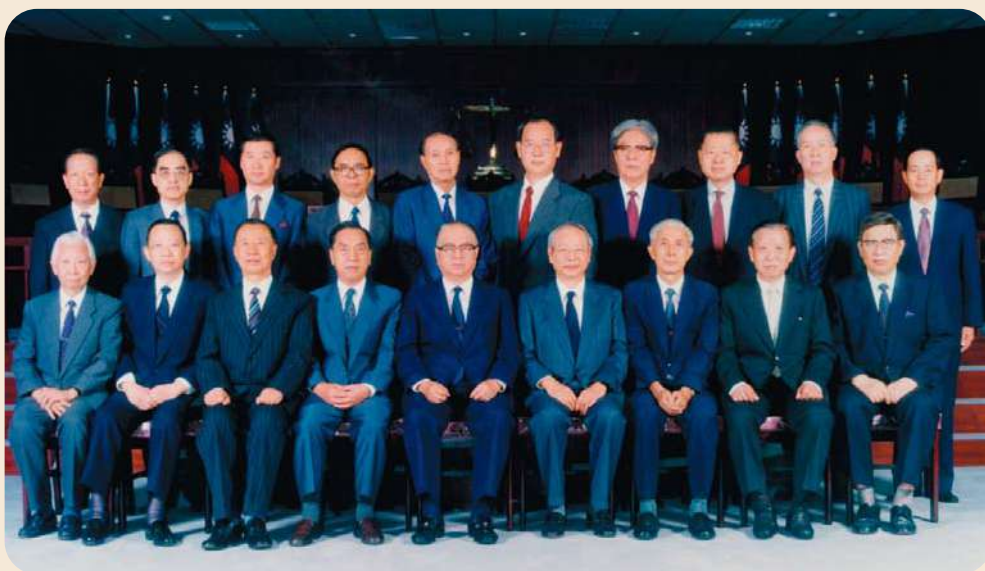
Justices of the Fifth Constitutional Court & Heads of the Judicial Yuan (Photographed in 1987)