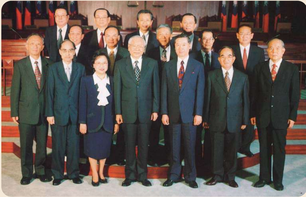
Justices of the Sixth Constitutional Court & Head of the Judicial Yuan (Photographed in 1999)