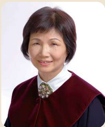
Chong-Wen CHANG (張瓊文) Justice of the Constitutional Court (Nov. 2016-)