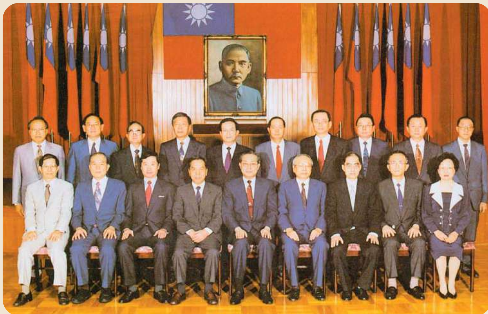
Justices of the Sixth Constitutional Court & Heads of the Judicial Yuan (Photographed in Oct. 1994)