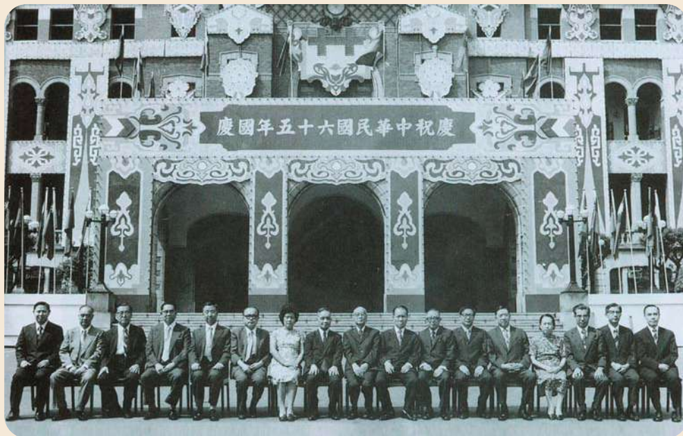
Justices of the Fourth Constitutional Court & Heads of the Judicial Yuan (Photographed in Oct. 1976)