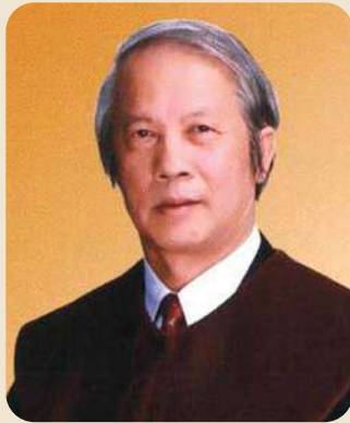
Hau-Min RAI (賴浩敏) Justice of the Constitutional Court & President of the Judicial Yuan ( Oct. 2010-Oct. 2016)