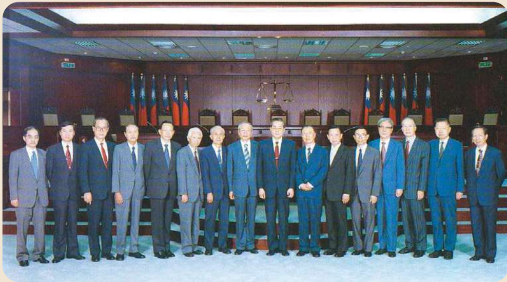
Justices of the Fifth Constitutional Court & Heads of the Judicial Yuan (Photographed in 1994)