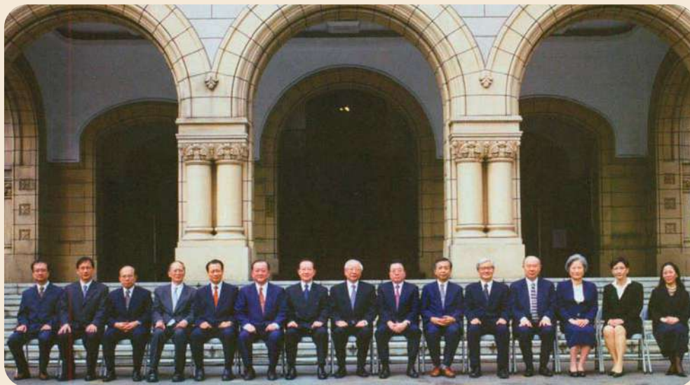
Justices of the Constitutional Court (Photographed in Nov. 2003)