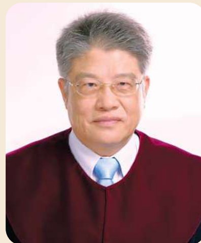
Chih-Hsiung HSU (許志雄) Justice of the Constitutional Court (Nov. 2016-)