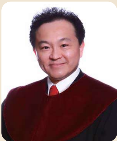
Dennis Te-Chung TANG (湯德宗) Justice of the Constitutional Court (Oct. 2011-)