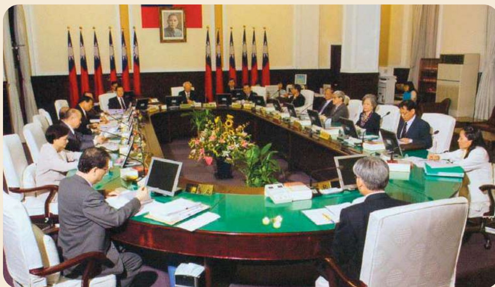
The Meeting of the Justices of the Constitutional Court (Photographed in Nov. 2003)