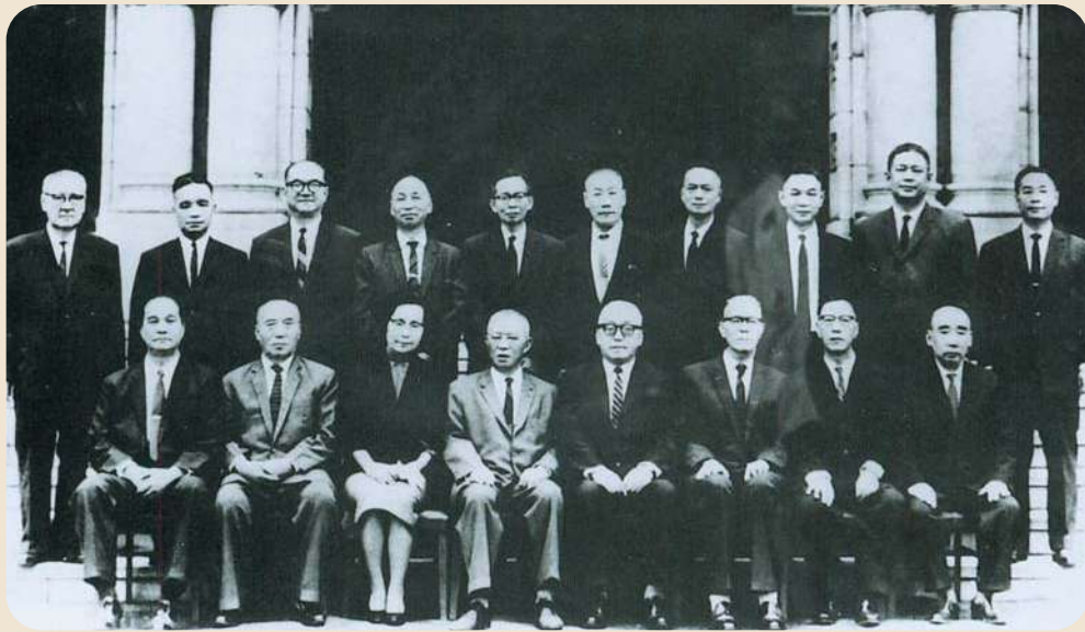
Justices of the Third Constitutional Court & Heads of the Judicial Yuan (Photographed in Oct. 1967)