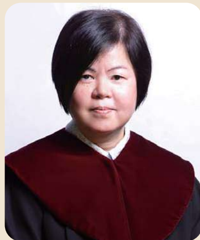
Horng-Shya HUANG (黃虹霞) Justice of the Constitutional Court (Oct. 2015-)