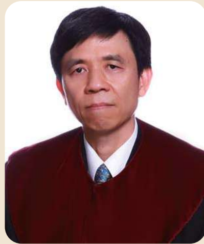
Chang-fa LO (羅昌發) Justice of the Constitutional Court (Oct. 2011-)