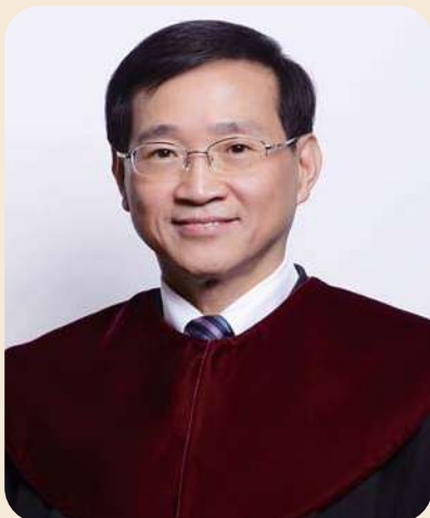
Jiun-Yi LIN (林俊益) Justice of the Constitutional Court (Oct. 2015-)