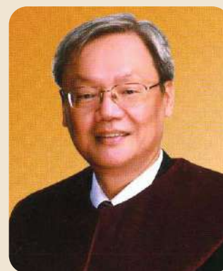
Yeong-Chin SU (蘇永欽) (Oct. 2010-Sep. 2016)