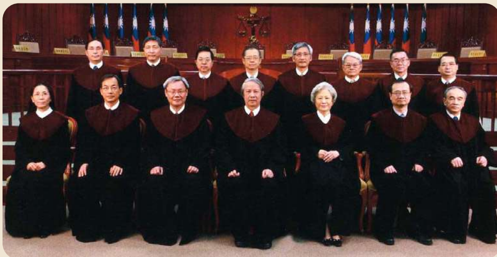
Justices of the Constitutional Court (Photographed in Nov. 2010)