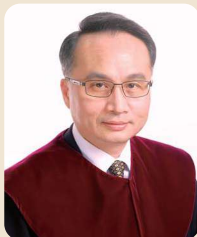
Jau-Yuan HWANG (黃昭元) Justice of the Constitutional Court (Nov. 2016-)