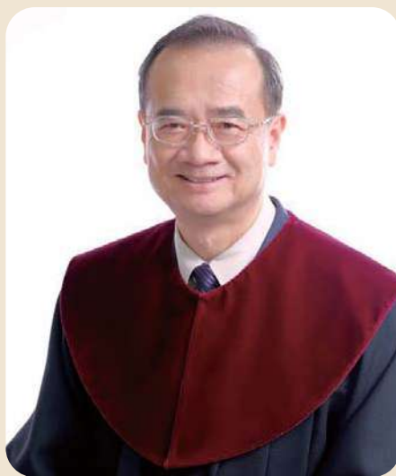
Tzong-Li HSU (許宗力) Chief Justice of the Constitutional Court & President of the Judicial Yuan (Nov. 2016-)