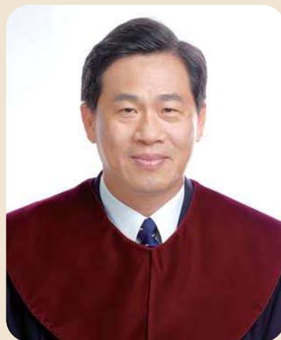
Jui-Ming HUANG (黃瑞明) Justice of the Constitutional Court (Nov. 2016-)