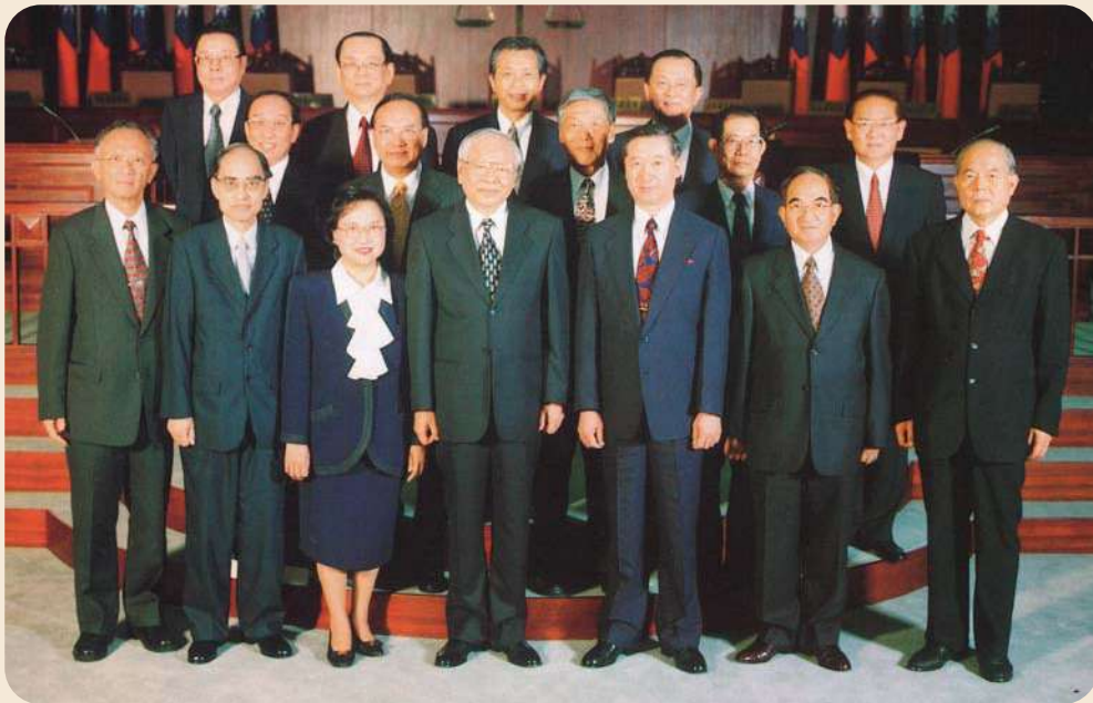
Justices of the Sixth Constitutional Court & Head of the Judicial Yuan (Photographed in 1999)