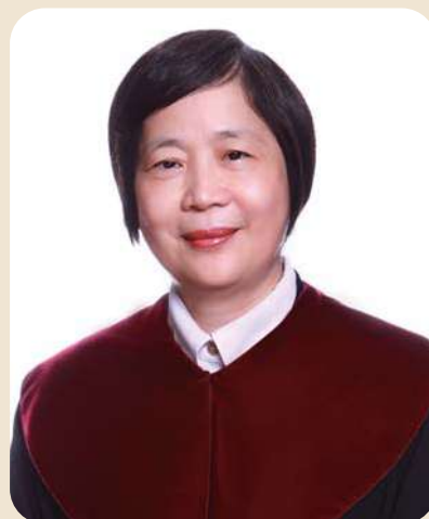
Beyue SU CHEN (陳碧玉) Justice of the Constitutional Court (Oct. 2011-)