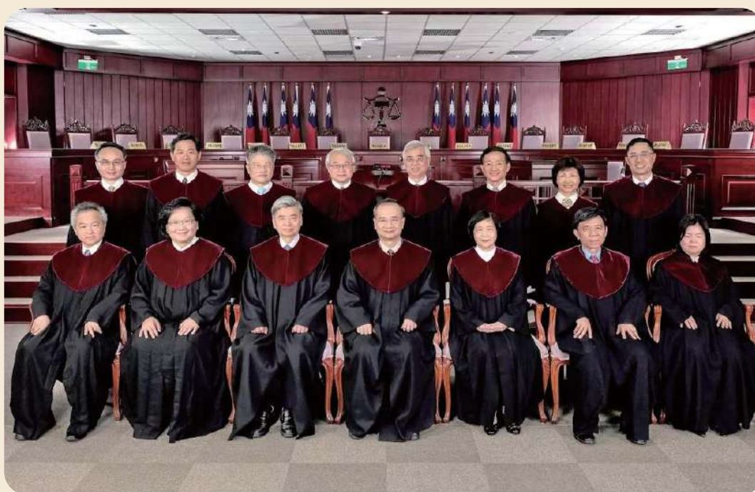
Justices of the Constitutional Court (Photographed in Nov. 2016).