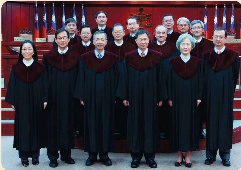
Justices of the Constitutional Court (Photographed in Nov. 2008)