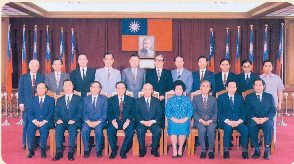
Justices of the Fifth Constitutional Court & Heads of the Judicial Yuan (Photographed in Oct. 1985)