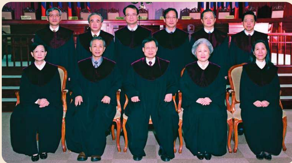
Justices of the Constitutional Court (Photographed in Nov. 2007)