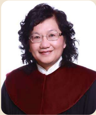
Hsi-Chun HUANG (黃璽君) Justice of the Constitutional Court (Oct. 2011-)