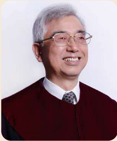
Chen-Huan WU (吳陳鐸) Justice of the Constitutional Court (Oct. 2015-)