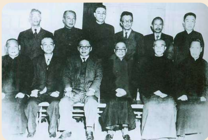
Justices of the First Constitutional Court & Heads of the Judicial Yuan (Apr. 1952)

The Constitution only provides for the powers and the appointment process of the Justices. It leaves blank the number, qualifications, and terms of office of the Justices. The Judicial Yuan Organization Act, enacted in March 1947, stipulated that there were to be nine Justices with life tenure, apparently modeled after the U.S. Supreme Court. In December of the same year, the Judicial Yuan Organization Act was revised to the effect that there were to be seventeen Justices, each serving a fixed and renewable nine-year term. The first ten Justices were sworn in as members of the First Constitutional Court in July 1948 and held their first meeting in September 1948. After rendering the first two J.Y. Interpretations in Nanjing, China, in January 1949, the First Constitutional Court soon ceased to function because of the outbreak of war in China. Although the acting President once appointed eight new Justices in March 1949, as of the end of 1951 there were only two Justices remaining in office in Taiwan. In other words, the Constitutional Court was not in operation for around three years between February 1949 and March 1952. In April 1952, seven newly-appointed Justices joined the Constitutional Court, which then had nine Justices and finally met the quorum of a majority of seventeen members. This re-organized First Constitutional Court