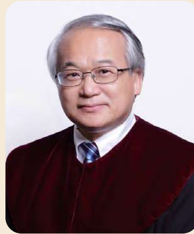
Ming-Cheng TSAI (蔡明誠) Justice of the Constitutional Court (Oct. 2015-)